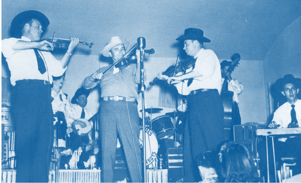
Bob Wills performs with his band