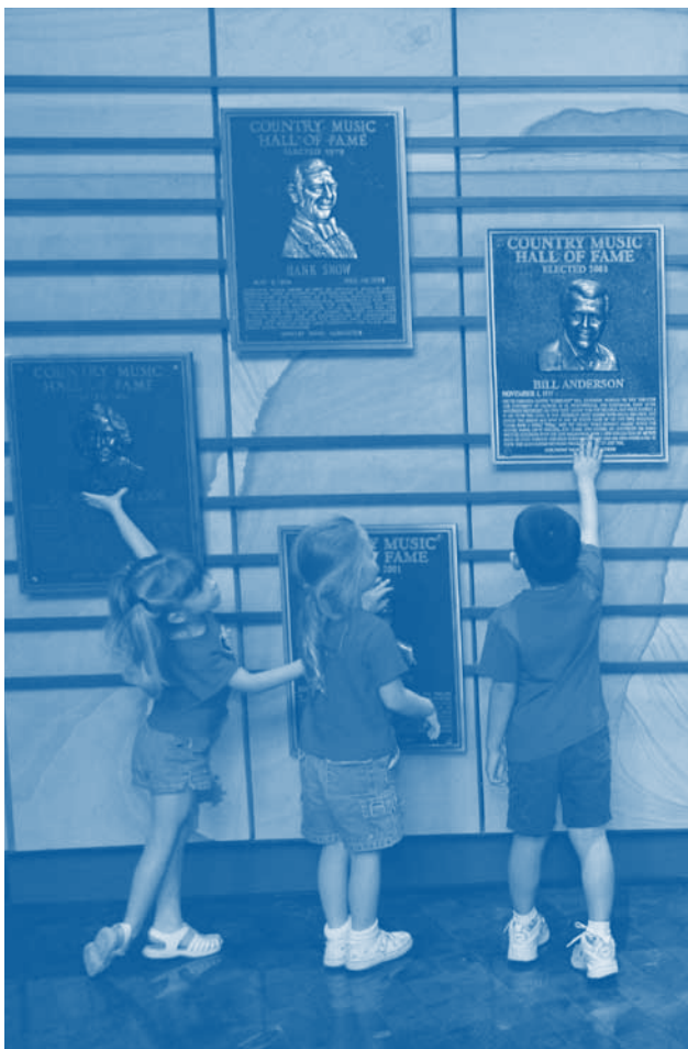
The Country Music Hall of Fame