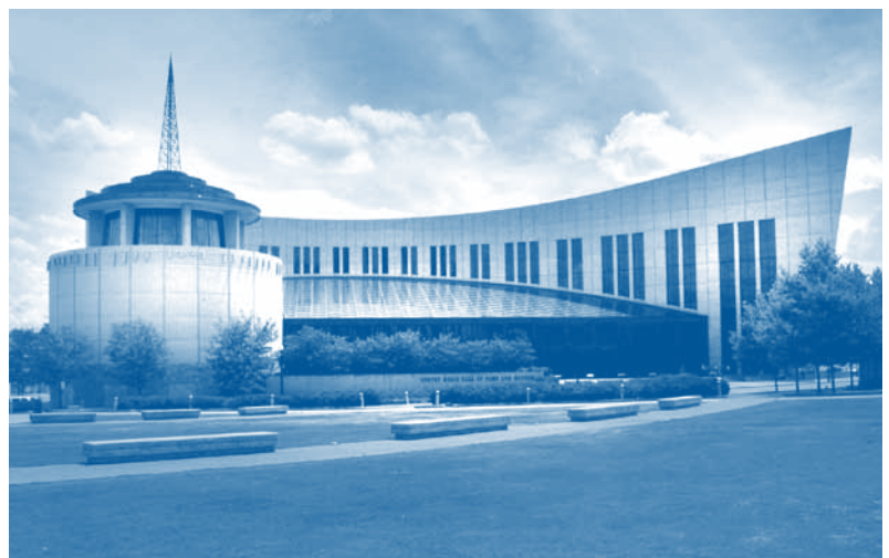
Country Music Hall of Fame and Museum

Have students use the Internet to research the induction criteria for the Country Music Hall of Fame and other halls of fame to help guide their own decisions about induction.