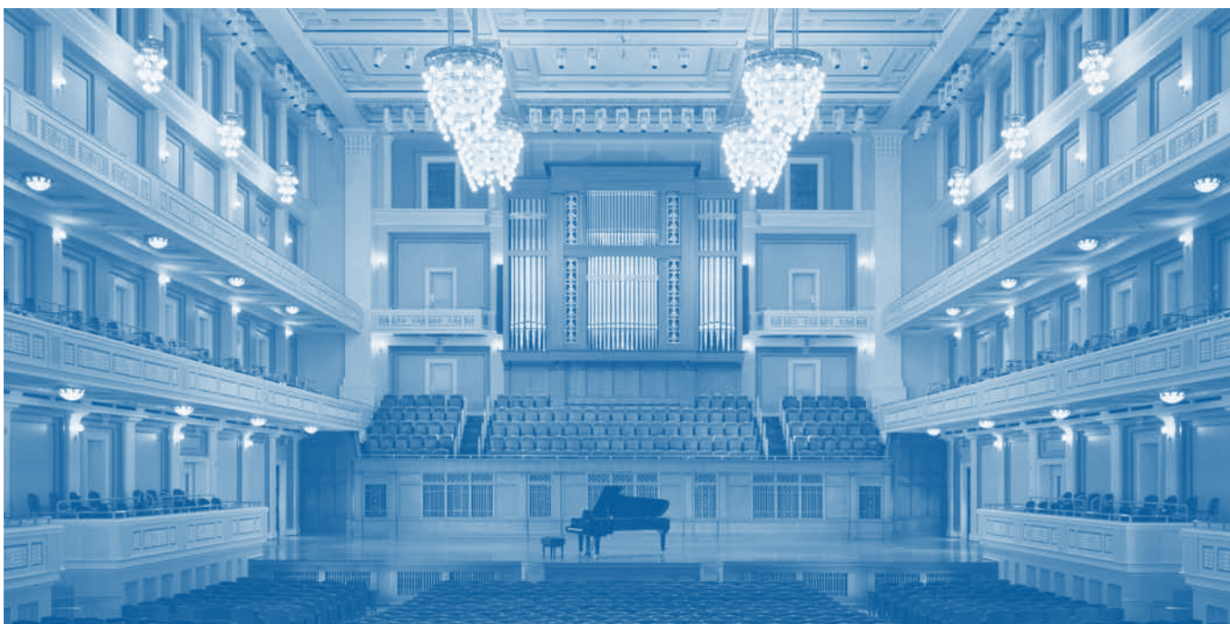
Laura Turner Symphony Hall in Schermerhorn Symphony Center